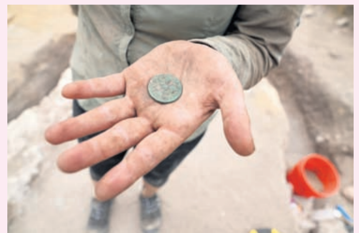
An archaeologist shows a coin found on top of the remains of an enslaved man, dated 1737, at the former Golden Rock plantation west of the international Airport in Oranjestad, on the Dutch Caribbean island of St. Eustatius, on the Leeward Islands, Thursday, May 27, 2021.